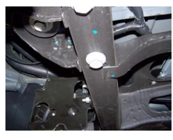
7. Install rear tailpipe hanger #I. Remove hitch bolt as seen in picture. Insert rubber grommet on hanger.

6. Install tailpipe #D into muffler 1.5-2" and secure with clamp #H. Do not tighten. Insert welded hanger into rubber grommet.