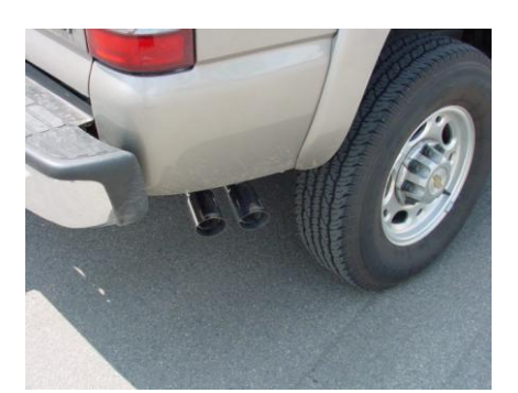
"MAKE SURE YOU HAVE A 1" CLEARANCE ON ALL PIPES FROM BRAKE AND FUEL LINES, SHOCKS, TIRES, ETC..."