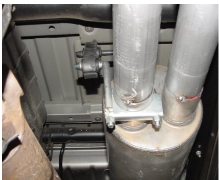
INSTALL HANGER #H INTO RUBBER GROMMET JUST ABOVE DRIVERS SIDE OF MUFFLER OUTLET. YOU WILL USE THIS CLAMP TO SECURE TAILPIPE TO MUFFLER, DO NOT TIGHTEN.