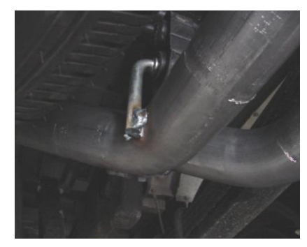
SLIDE DRIVERS SIDE TAILPIPE #D INTO MUFFLER 1-1/2" TO 2". INSERT WELDED HANGER INTO RUBBER GROMMET.

SLIDE PASSENGER SIDE HEADPIPE #A ONTO STOCK HEADPIPE. INSERT WELDED HANGER INTO RUBBER GROMMET. NEXT INSTALL DRIVERS SIDE HEADPIPE #B ONTO STOCK HEADPIPE, USE CLAMP #G TO SECURE BOTH HEADPIPES, DO NOT TIGHTEN.