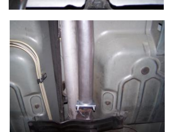
5. Install head pipe #A onto your existing stock front pipe and attach with clamp #F. Use a jack stand to support the converter. Do not tighten.