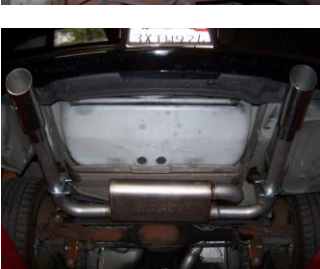
7. Next, install the exit pipes #C. Use clamp #E to secure tail pipes.