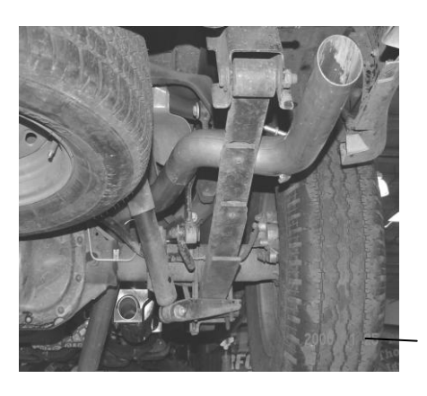
INSTALL OVERAXLE TAILPIPE #B INTO MUFFLER. INSERT WELDED HANGER INTO FACTORY RUBBER GROMMET. CLAMP DOWN WITH HANGER #D TO MUFFLER. DO NOT TIGHTEN

LAY OUT THE EXHAUST AND COMPARE THE PART NUMBERS TO THE MANUAL. FOR AN EASIER REMOVAL OF THE FACTORY EXHAUST CUT JUST BEHIND THE REAR MUFFLER HANGER AND REMOVE THE TAIL PIPE. THEN UN-BOLT THE FLANGE AND CLAMP IN FRONT OF THE STOCK MUFFLER. YOU WILL RE-USE THE DRIVERSIDE FLANGE GASKET, BOLTS. LEAVE ALL FACTORY RUBBER GROMMETS IN PLACE.