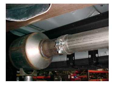
Lay out the exhaust on the floor so it looks like the drawing and compare parts with manual

1/2", 9/16", 15mm Socket & Wrench, WD-40, Jack Stand, Hacksaw