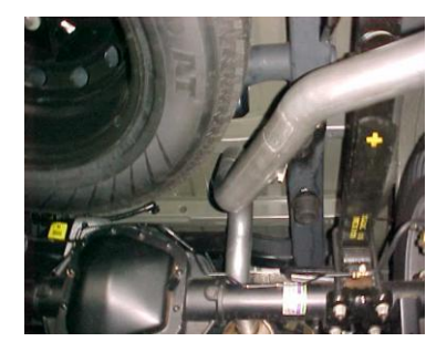
INSTALL OVERAXLE TAILPIPE #C INTO MUFFLER 1 ½" TO 2". INSERT HANGERS INTO RUBBER GROMMETS.USE CLAMP #E TO SUCURE PIPE TO MUFFLER.DO NOT TIGHTEN.

INSTALL HEADPIPE # A INTO STOCK PIPE. THE END OF THE PIPE SHOULD BE AT THE 9 O'CLOCK POSITION, ATTACH TO FACTORY CLAMP. DO NOT TIGHTEN.