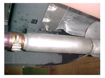
IF YOU HAVE A FX4 EDITION TRUCK, USE HANGER #H.INSERT HANGER INTO RUBBER GROMMET THEN CLAMP TO INLET OF MUFFLER.

INSTALL HEADPIPE # A INTO STOCK PIPE. THE END OF THE PIPE SHOULD BE AT THE 9 O'CLOCK POSITION, ATTACH TO FACTORY CLAMP. DO NOT TIGHTEN.