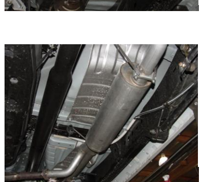
INSTALL MUFFLER #B ONTO HEADPIPE ASSEMBLY AT LEAST 1-1/2" TO 2". USE A JACK STAND TO SUPPORT THE MUFFLER. THE OUTLET OF THE MUFFLER SHOULD BE AT THE 6 O'CLOCK POSITION.