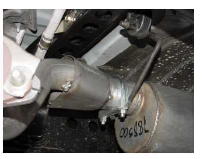
INSTALL FRONT MUFFLER HANGER #F INTO RUBBER GROMMETS LOCATED JUST ABOVE THE INLET OF THE MUFFLER. USE THIS CLAMP TO SECURE HEADPIPE. DO NOT TIGHTEN.