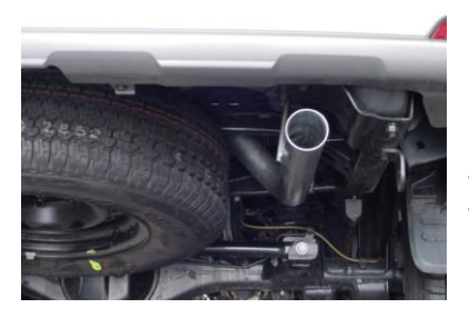
INSTALL EXITPIPE #D ONTO OVERAXLE TAILPIPE. INSERT WELDED HANGERS INTO RUBBER GROMMETS. USE CLAMP #H TO SECURE TO THE TAILPIPE. DO NOT TIGHTEN.