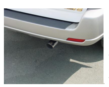
INSTALL THE STAINLESS TIP #E. TO CLEAN TIP USE ANY STAINLESS OR ALUMINUM CLEANER AND A SCOTCH BRITE PAD. NOW GO BACK AND TIGHTEN ALL NUTS, BOLTS AND CLAMPS STARTING FROM THE FRONT AND WORKING BACK.

"MAKE SURE YOU HAVE A MINIMUM OF A 1" CLEARANCE ON ALL PIPES FROM ALL RUBBER BRAKE LINES, TIRES, SHOCKS, SPARE TIRE, FUEL LINES, ETC."