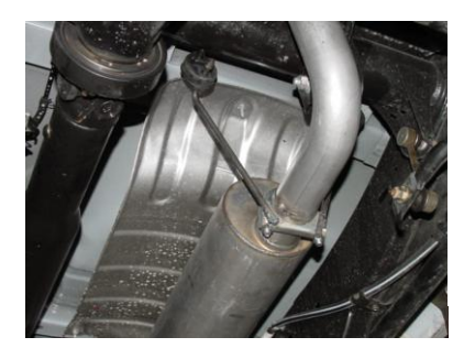
INSTALL HANGER #G INTO RUBBER GROMMET LOCATED JUST ABOVE THE OUTLET OF THE MUFFLER. USE THIS HANGER TO SECURE MUFFLER TO TAILPIPE. DO NOT TIGHTEN.

INSTALL OVERAXLE TAILPIPE #C INTO MUFFLER 1-1/2" TO 2". INSERT WELDED HANGER INTO RUBBER GROMMET.