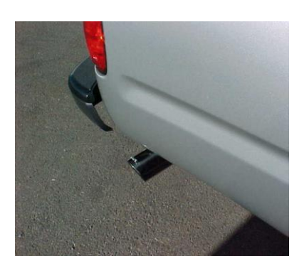
NEXT INSTALL YOUR STAINLESS STEEL TIP TO YOUR DESIRED LOOK. USE ANY ALUMINMUM OR STAINLESS STEEL CLEANER TO POLISH YOUR TIP. THEN TIGHTEN ALL CLAMPS AND HANGERS

SLIP MUFFLER #B ONTO HEADPIPE #A NO MORE THEN 2" AND NO LESS THEN 1". THE MUFFLER INLET WILL HAVE THE INSIDE LOUVERS FACING FORWARD. THE OUTLET OF THE MUFFLER WILL BE POSITIONED AT 12 O'CLOCK. USE A JACK STAND TO SUPPORT THE MUFFLER.