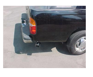
Install stainless steel tip. Clamp down. When you have everything in place, firmly tighten all bolts and clamp down securely. To clean stainless steel tip use any stainless steel cleaner and Scotch Brite pad.

Install muffler #B onto head pipe 1-1/2" to 2" with the louvers facing towards the converter. Use a jack stand to support the muffler. Use clamp #F to secure the muffler to the head pipe. Do not tighten. Muffler inlet is looking into the louvers.