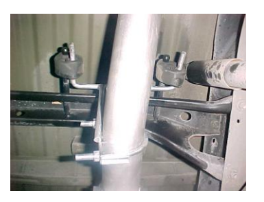
Next install rear muffler hanger # D into grommets at just about the outlet of the muffler clamp onto tailpipe. Do not tighten.

Install head pipe # A on to your existing stock front pipe and secure with clamp # G.