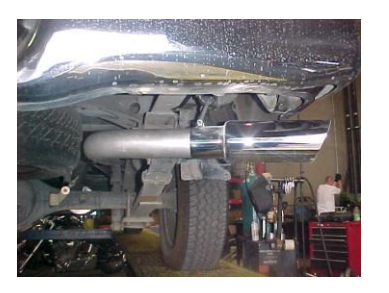
Install the over axle tailpipe # C into the muffler 1-1/2" to 2". Secure to the muffler using clamp #F Do not tighten. Insert welded hanger into rubber grommet.

Lay out the exhaust on the floor so it looks like the drawing and compare parts with manual. To remove the stock exhaust Cut it 17 1/2" in front of the muffler. Leave all rubber grommets in place. Use WD-40 to aid in removal of exhaust and hangers.