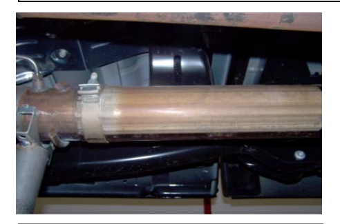
2. Install Item # A on to your factory exhaust using clamp # D to secure. Do not tighten.

1. Disconnect the negative battery cable before removal of the OEM Exhaust. This will allow the computer to reset and recognize the new exhaust. Lay out the exhaust on the floor so it looks like the drawing and compare parts with manual. Remove the factory exhaust by cutting behind the factory muffler. Once the tail pipe has been removed un-bolt the muffler and head pipe at the clamp located behind of the DPF. Use wd-40 or another type of penetrating oil to remove the rubber grommets. Do not damage these they will be re used.