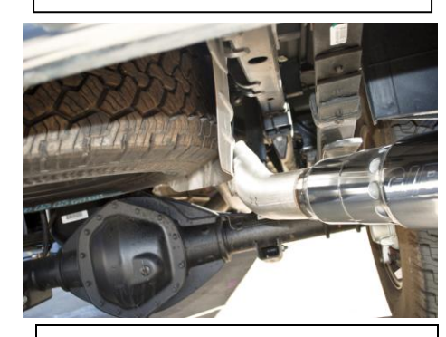
6. Install the exit pipe Item # B onto the over axle pipe. Do not tighten. Keep everything loose until you have proper clearance.