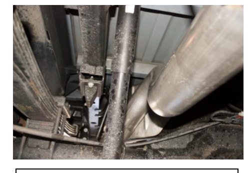
5. Be sure there is clearance from the spare tire and shock.