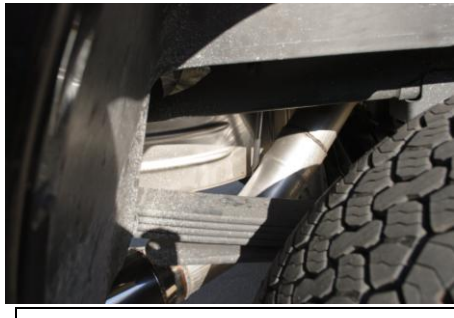
4. You may need to make some adjustments to find the correct location of the over axle pipe.