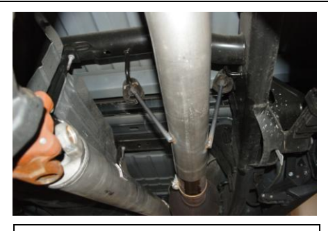
3. Install the over axle pipe Item # B onto the Gibson head pipe. Install the hangers into the factory rubber grommets. Adjust to desired position and to not tighten.