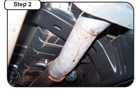
Install head pipe # A onto your existing stock front pipe and attach with clamp #E. Do not tighten . Insert welded hanger into rubber grommet.

To remove the stock exhaust, remove your factory exit pipes. Next, remove your tailpipe by unbolting from the back of your stock muffler. Remove your factory muffler from the clamp in front of it. Use WD-40 to aid in removal of facotry grommet that will be re-used.