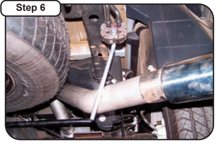
Attach Stainless Steel Tip. When you have everything in place, firmly tighten all bolts and clamps down securely. Use stainless steel cleaner and a Scotch Brite pad weekly to prevent tip from discoloration. Inspect all fasteners after 25-50 miles of operation and re-tighten if necessary.