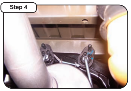
Next, install band clamp # F onto muffler, attaching with bolt kit #G. Insert hangers into rubber grommets. Do not tighten.

Install muffler #B onto head pipe #A 1 1/2"-2" with the louvers facing towards the converter. Use a jack stand to support the muffler. Use clamp #E to secure the muffler to the headpipe. Do not tighten. Muffler inlet is looking into the louvers. Outlet should be at the 10' O'clock position.