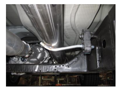
your existing stock flange and secure using the stock hardware. Do not tighten. Insert welded hanger into rubber grommet.

5. Slide tailpipe #C into muffler 1½"-2" and secure with clamp #F. Do not tighten. Insert welded hangers into rubber grommets.