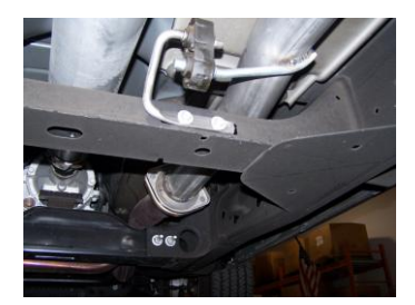
3. Install headpipe #A onto your existing stock flange and secure using the stock hardware. Do not tighten. Insert welded hanger into rubber grommet.