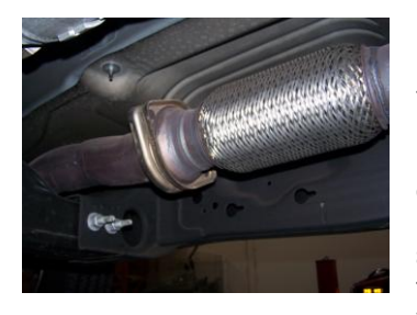
2. Remove the stock exhaust by unbolting it at the 2-bolt flange located in front of the muffler. Disengage the welded hangers from the OEM rubber grommets. Use WD-40 to aid in this process. Do not damage stock nuts and bolts or remove the rubber grommets as you will re-use them to mount your new system. Now, cut off tailpipe and remove system.

1. Disconnect the negative battery cable before removal of OEM exhaust. This will allow the computer to reset and recognize the new exhaust. Lay out the exhaust on the floor so it looks like the drawing and compare parts with manual.