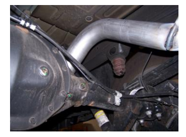
5. Slide tailpipe #C into muffler 1½"-2" and secure with clamp #F. Do not tighten. Insert welded hangers into rubber grommets.