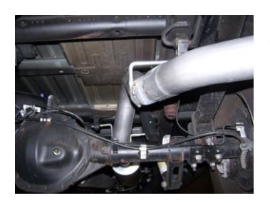
7. Slide exit pipe #D over tailpipe and secure with clamp #F. Do not tighten. Rotate exit pipe to best suit your vehicle.