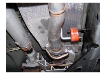
3. Install head pipe #A onto your existing stock front pipe and attach with bolt kit #F. Insert welded hanger into rubber grommet.