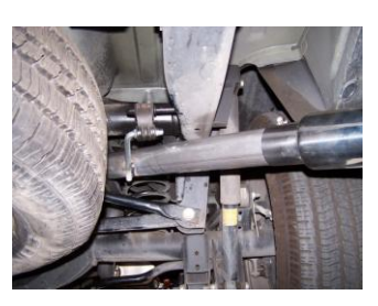
5. Install tailpipe #C into the muffler 1\frac{1}{2}-2^{"} . Insert welded hangers into rubber grommets use clamp #E to secure to muffler. Do not tighten.

2. To remove the stock exhaust, remove it from the 2 bolt flange located in front of the muffler. Disengage the welded hangers using WD-40 from the OEM rubber grommets. Do not damage or remove the rubber grommets as you will reuse them to mount your new system. Now, cut off tailpipe before and after rear axle for removal.