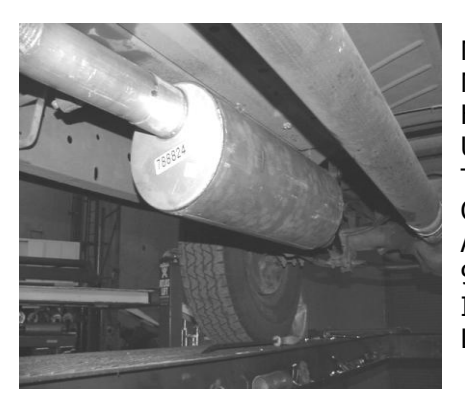
NEXT, CONNECT THE MUFFLER # B TO THE HEADPIPE USING CLAMP # F. USE JACKSTAND TO SUPPORT THE MUFFLER. THE OUTLET OF THE MUFFLER WILL BE AT APPROXIMATELY 9 O'CLOCK. THE MUFFLER INLET IS LOOKING INTO THE LOUVERS.