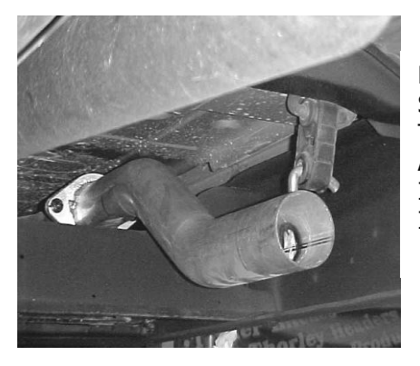
BOLT HEADPIPE #A TO THE STOCK FLANGE RE-USING THE FACTORY NUTS, BOLTS AND GASKET. INSERT WELDED HANGER INTO RUBBER GROMMET.

INSTALL OVERAXLE TAILPIPE #C TO THE OUTLET OF THE MUFFLER USING HANGER #G. INSERT WELDED HANGER INTO RUBBER GROMMET.