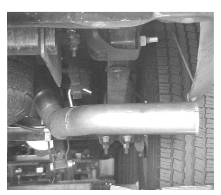
INSTALL TURNOUT PIPE #D INTO OVERAXLE TAILPIPE USING CLAMP# F. ROTATE EXIT PIPE UNTIL IT IS AT THE CORRECT ANGLE FOR YOUR TRUCK.