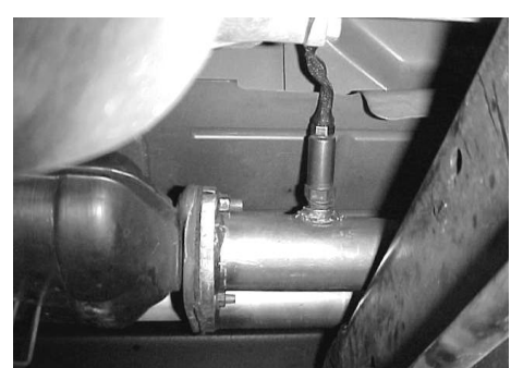
RE-INSTALL O2 SENSOR. USE A SMALL AMOUNT ANTI-SEIZE ON THE THREADS. NOW FIRMLY TIGHTEN ALL CLAMPS, HANGERS, FLANGE, AND BOLTS.