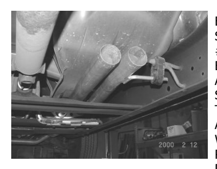
BOLT HEADPIPE #A USING SUPPLIED FLANGE GASKET #G AND REUSING FACTORY BOLTS. APPLY A SMALL A MOUNT OF HIGH-TEMP O2 SENSOR SAFE SILICONE ON THE FLANGE TO PREVENT ANY LEAKS. INSERT WELDED HANGER INTO RUBBER GROMMET. DO NOT TIGHTEN

INSTALL THE OVERAXLE TAILPIPE #C INTO MUFFLER AT LEAST 1 1/2" TO 2" USING CLAMP #G. DO NOT TIGHTEN. INSERT WELDED HANGERS INTO RUBBER GROMMETS. THE SPARE TIRE ON SOME VEHICLES MAY NEED TO BE LOOSEN ED AND PULLED TO THE DRIVER SIDE AND RF-TIGHTENED . ROTATE PIPES UNTIL YOU HAVE AT LEAST A 1" CLEARANCE AWAY FROM SHOCK, BRAKE LINES, SPARE TIRE, ECT.