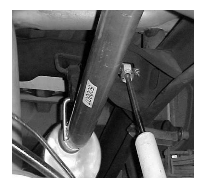
SLIDE MUFFLER WITH DUAL INLET ONTO HEADPIPE AT LEAST 1-1/2" TO 2". MUFFLER OUTLET SHOULD BE AT THE 12 O'CLOCK POSITION. USE CLAMPS #F TO ATTACH TO THE HEADPIPE. MAKE SURE INLETS AND MUFFLER IS LEVEL. AND TIGHTEN DOWN. USE JACK STAND TO SUPPORT MUFFLER.

INSTALL TURNOUT PIPE #D INTO TAILPIPE USING CLAMP #G . INSTALL THE STAINLESS TIP AND CLAMP DOWN. USE ANY STAINLESS STEEL OR ALUMINUM CLEANER TO POLISH TIP. TIGHTEN ALL NUTS ,BOLTS AND CLAMPS.