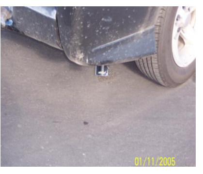
Install stainless steel tip. Clamp down. To clean stainless steel tip, use a scotch brite pad and any stainless steel or aluminum cleaner. When you have everything in place, firmly tighten all bolts and clamps.

Install rear muffler hanger #D onto outlet of muffler. Do not tighten.