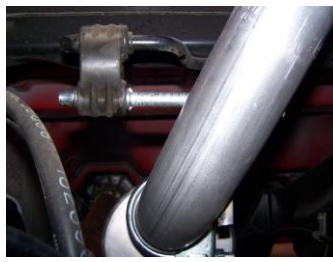
5. Install tailpipe #C into muffler approximately 1½-2". Secure tailpipe with clamp #E. DO NOT TIGHTEN. Insert welded hanger into rubber grommet.