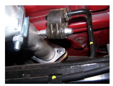
3. Install headpipe #A onto your existing stock flange using bolt kit #F to secure flange. DO NOT TIGHTEN. Insert welded hanger into rubber grommet.