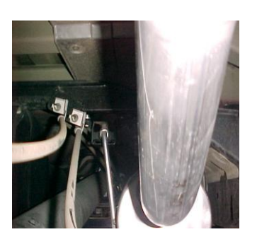
INSTALL BAND CLAMP # F ONTO MUFFLER, INSERT HANGER INTO RUBBER GROMMET, USE BOLT KIT PROVIDED, DO NOT TIGHTEN.