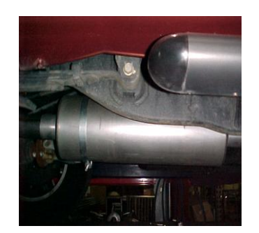
INSTALL MUFFLER # C ONTO YOUR RESONATOR 1 ½" –2". USE CLAMP # G TO SECURE MUFFLER TO THE PIPE, DO NOT TIGHTEN.

NEXT, UN-BOLT YOUR EXHAUST FROM THE 2-BOLT FLANGES LOCATED JUST BEHIND YOUR FACTORY CATALYTIC CONVERTERS, DO NOT DISGUARD YOUR FACTORY GASKETS AND HARDWARE YOU WILL RE-USE IT.