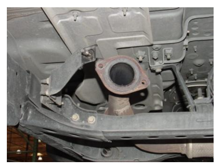
INSTALL HEADPIPE #A ONTO STOCK FLANGE, RE-USING YOUR STOCK GASKET, NUTS AND BOLTS. DO NOT TIGHTEN. JUST SNUG IT UP. INSERT HANGER INTO RUBBER

TO REMOVE STOCK EXHAUST, UN-BOLT THE 2-BOLT FLANGE LOCATED JUST IN FRONT OF THE STOCK MUFFLER. DO NOT DAMAGE STOCK NUTS, BOLTS AND GASKET. YOU WILL NEED TO RE-USE THEM.