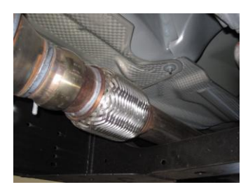
unclamp it at the ball flange behind the Y-pipe. Make sure to leave all rubber grommets in the factory location. You will re-use stock clamp. For easier removal of exhaust, cut behind the muffler. Use WD-40 to remove hangers from grommets.

1. Disconnect the negative battery cable before removal of OEM exhaust. This will allow the computer to reset and recognize the new exhaust. Lay out the exhaust on the floor so it looks like the drawing and compare parts with manual.