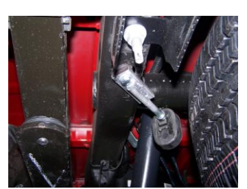
5. Install metal hanger #H into hole located approximately 16" from the rear of the frame. Use hardware kit #I, washer #M, and rubber grommet #J.

8. Install exit pipes #E onto tailpipes. Cut to your preferred length then use clamps to secure exit pipes to tailpipes. Install stainless steel tips. Clamp down. When you have everything in place, firmly tighten all bolts and clamps down securely. Use stainless steel cleaner weekly to prevent tip from discoloration. Inspect all fasteners after 25-50 miles of operation and re-tighten as necessary.