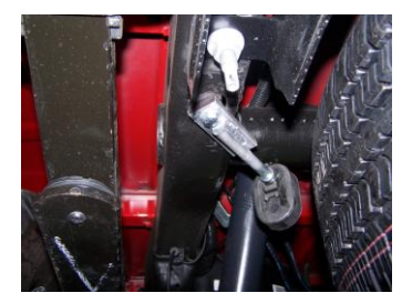
5. Install metal hanger #H into hole located approximately 16" from the rear of the frame. Use hardware kit #I, washer #M, and rubber grommet #J.

Install muffler #B onto head pipe. Use jack stands to support the muffler. Use clamp #F to secure the muffler to headpipe. Do not tighten.