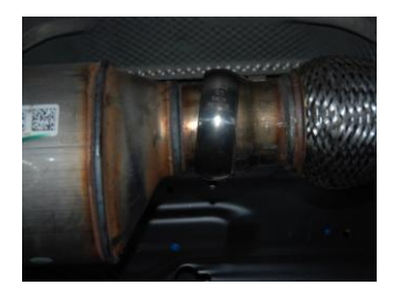
2. To remove stock exhaust, unclamp it at the ball flange behind the Y-pipe. Make sure to leave all rubber grommets in the factory location. You will re-use stock clamp. For easier removal of exhaust, cut behind the muffler. Use WD-40 to remove hangers from grommets.

1. Disconnect the negative battery cable before removal of OEM exhaust. This will allow the computer to reset and recognize the new exhaust. Lay out the exhaust on the floor so it looks like the drawing and compare parts with manual.