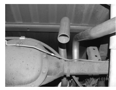
INSTALL DRIVERS SIDE FRONT TAILPIPE # D INTO MUFFLER 1-1/2" TO 2". USE CLAMP # I AND ATTACH IT TO THE MUFFLER. DO NOT TIGHTEN.

INSTALL HEADPIPE # A USING BOLT KIT # N AND # K GASKET. AND ATTACH IT TO THE STOCK FLANGE. DO NOT TIGHTEN.