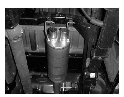
INSTALL MUFFLER #B ONTO HEADPIPE 1-1/2" TO 2" USING CLAMP #J. INSERT WELDED HANGERS INTO RUBBER GROMMET. MAKE SURE OUTLETS ARE LEVEL. USE A JACKSTAND TO SUPPORT MUFFLER. DO NOT TIGHTEN.