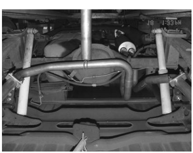
INSTALL DRIVERS SIDE OVERAXLE PIPE # E ONTO FRONT TAILPIPE USING CLAMP #I. USE CLAMP # I TO HOLD TAILPIPE UP TO REAR HANGER # G. DO NOT TIGHTEN.