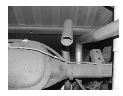
INSTALL DRIVERS SIDE FRONT TAILPIPE # D INTO MUFFLER 1-1/2" TO 2". USE CLAMP # J AND ATTACH IT TO THE MUFFLER. DO NOT TIGHTEN.

INSTALL HEADPIPE # A USING BOLT KIT # L AND # N GASKET. INSERT WELDED HANGER INTO RUBBER GROMMET AND ATTACH TO STOCK FLANGE. DO NOT TIGHTEN.