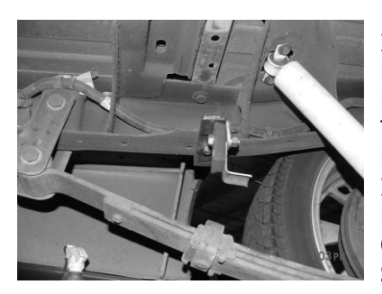
INSTALL HANGER # G ON THE PASSENGER TAILPIPE AND HANGER # H ON DRIVERSIDE TAILPIPE. MEASURE 19" FROM REAR OF FRAME AND BOLT INTO THE EXISTING ROUND HOLES (ABOUT 7/8") LOCATED ON THE FRAME ON BOTH SIDES OF THE VEHICLE.

INSTALL DRIVERS SIDE OVERAXLE PIPE # E ONTO FRONT TAILPIPE USING CLAMP #J. USE CLAMP # J TO HOLD TAILPIPE UP TO REAR HANGER # H. DO NOT TIGHTEN.