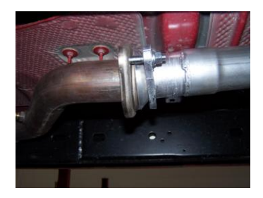
3. Install headpipe #A onto your existing stock 2-bolt flange. Use bolt kit #F to secure. Use jack stand to support converter. Install front muffler hanger #G. Insert hanger into rubber grommet. Do not tighten.

6. Install the driver side over axle tailpipe #C into muffler 1.5-2". Use clamp #H to secure tailpipe and muffler. Insert welded hangers into rubber grommets.