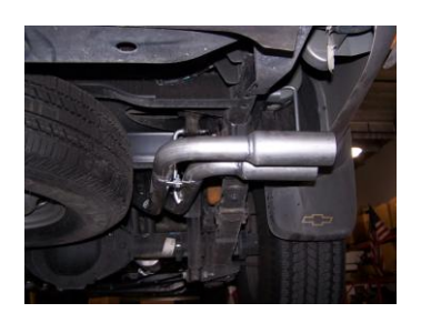
7. Install passenger side tailpipe #D into muffler 1.5-2" and attach with clamp #H. Use bolt kit #I to attach the tailpipes together. Do not tighten. Insert welded hanger into rubber grommet.