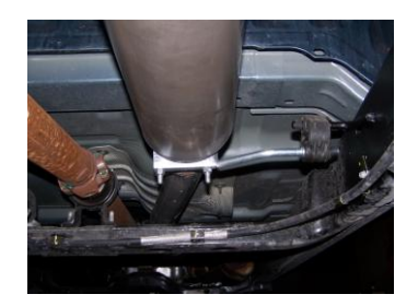
5. Next, install front muffler hanger #F onto muffler. Insert hanger into rubber grommets. Do not tighten.

9. Install exit pipes ( #E ) onto tailpipe, use clamps ( #H ) to secure pipes together. Do not tighten. Use zip ties to secure brake and fuel lines away from exhaust.