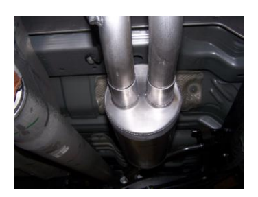
4. Install muffler ( #B ) onto headpipe ( #A ) 1.5-2" with louvers facing towards the converter. Use a jack stand to support the muffler. Outlet of muffler will be level.