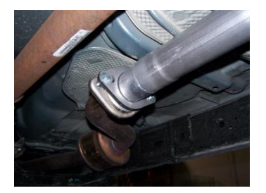
3. Install headpipe ( #A ) onto your existing stock 2-bolt flange. Use bolt kit ( #J ) to secure. Leave loose until the whole system is installed.

6. Next, install the driver side rear tailpipe hanger ( #G ) and clamp ( #H ). It will be installed just in front of the rear bed mount on the driver side.