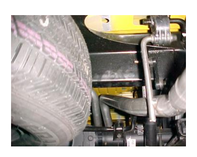
8. Install passenger side tailpipe (#D) into muffler 1.5-2". Insert welded hanger into rubber grommet. Use clamp (#H) to secure. Do not tighten.

9. Install exit pipes ( #E ) onto tailpipe, use clamps ( #H ) to secure pipes together. Do not tighten. Use zip ties to secure brake and fuel lines away from exhaust.