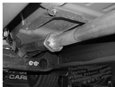
BOLT HEADPIPE (#A) TO STOCK FLANGE RE-USING FACTORY NUTS. DO NOT TIGHTEN. SLIDE WELDED HANGER INTO RUBBER GROMMET

INSTALL METAL HANGERS (#H) INTO HOLES LOCATED APPROX. 16" FROM THE REAR OF THE FRAME. METAL HANGERS ARE MOUNTED ON THE OUTSIDE OF FRAME. USE THE HARDWARE PROVIDED. THE BOLT AND WASHER WILL GO INTO THE 3<sup>RD</sup> HOLE FROM THE TOP OF THE HANGER. YOU MAY NEED TO LOOSEN SPARE TIRE FOR EASIER REMOVAL.