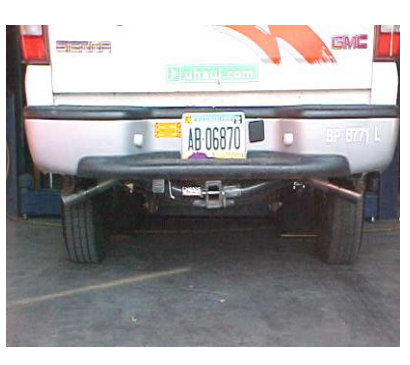
INSTALL MUFFLER (#B) ONTO HEADPIPE AT LEAST 1\frac{1}{2} " TO 2". USE CLAMP #F TO SECURE MUFFLER TO HEADPIPE. DO NOT TIGHTEN. USE A JACK STAND TO SUPPORT THE MUFFLER. OUTLETS SHOULD BE AT THE TOP. INSTALL HANGER #I ONTO DRIVERSIDE MUFFLER OUTLET AND INSERT WELDED HANGER INTO GROMMET. DO NOT TIGHTEN.