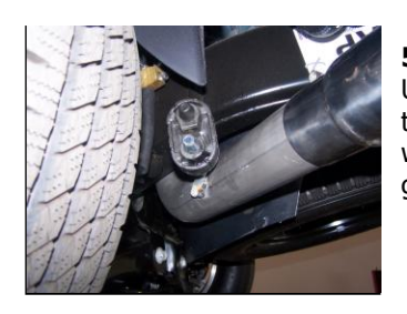
5. Next, install the exit pipes #D. Use clamp #F to secure to the tailpipe. DO NOT TIGHTEN. Insert welded hanger into rubber grommet.