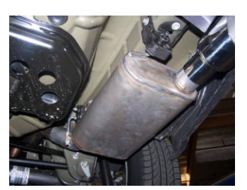
3. Install muffler assembly onto factory pipe, use clamp #B to secure. DO NOT TIGHTEN. Next tighten grommets to frame and adjust muffler assembly.