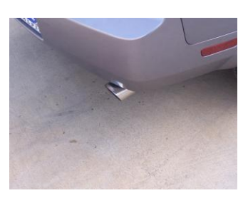
4. Install stainless steel tips. Clamp down. When you have everything in place, firmly tighten all bolts and clamps down securely. Use stainless steel cleaner and a Scotch Brite pad weekly to prevent tip from discoloration.