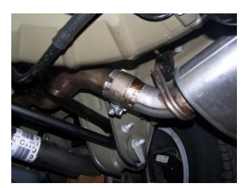
1. Remove your stock assembly from the clamp located in front of your stock muffler, unbolt the factory hangers from the frame.