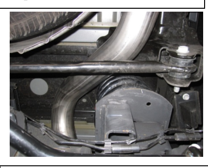
4. Install over axle pipe Item # B into the muffler outlet 1.5" to 2". Slip the hangers into the rubber grommets and keep tailpipe loose use clamp #c to secure together.