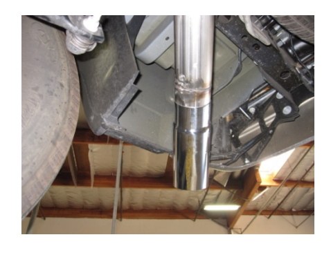
7. Be sure to check all clearance after each section has been tightened to be sure there is proper clearance. It may take 4-500 miles for your vehicle to fully adjust to the changes in exhaust flow.

"MAKE SURE YOU HAVE A 1" CLEARANCE ON ALL PIPES FROM ALL RUBBER BRAKE LINES, SHOCK BOOTS, TIRES, ETC..." TORQUE ALL CLAMPS TO APPROX. 100 TO 150 FT LBS.