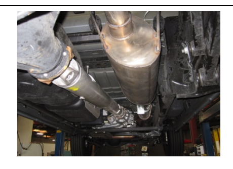
3. Install muffler assembly #A onto factory pipe insert hangers into rubber grommets use clamp #c to secure together do not tighten.