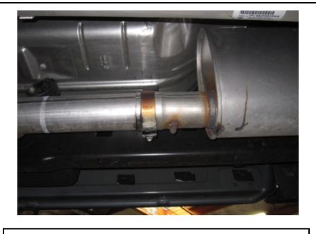
1.Remove from the first clamp located in front of the muffler.

1. Disconnect the negative battery cable before removal of the OEM Exhaust. This will allow the computer to reset and recognize the new exhaust. Lay out the exhaust on the floor so it looks like the drawing and compare parts with manual. Remove the factory exhaust by cutting behind the factory muffler. Once the tail pipe has been removed un-bolt the muffler and head pipe at the clamp located in front of the factory muffler. Use wd-40 or another type of penetrating oil to remove the rubber grommets. Do not damage these they will be re used.