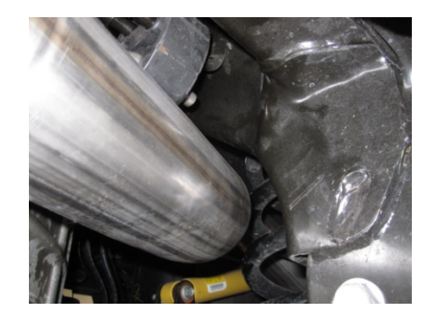
5. With everything loose you may need to adjust the system for proper clearance of shocks, brake lines, ect.