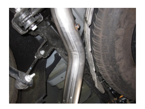
6. With proper clearance from spare tire install the exhaust tip onto the tailpipe. The system was designed to have the tip 1" below the quarter panel of the vehicle. With the tip in your desired position begin to tighten down all clamp connections from the front head pipe back.