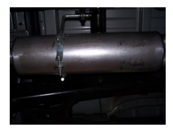
3. Install muffler #B onto head pipe #B 1½"-2" with the louvers facing towards the converter. Use a jack stand to support the muffler. Use clamp #F to secure the muffler to the headpipe. Do not tighten. Muffler inlet is looking into the louvers.

6. Install exit pipe #D onto overaxle tail pipe. Use clamp #F to secure. DO NOT TIGHTEN.