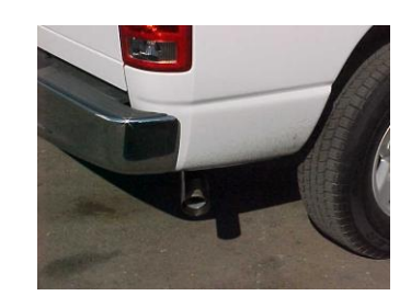
7. Install stainless steel tip #E. Clamp down. When you have everything in place, firmly tighten all bolts and clamps down securely. Use stainless steel cleaner and a Scotch Brite pad weekly to prevent tip from discoloration.