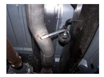
2. Install head pipe #A onto your existing stock front pipe and attach with clamp #F. Use a jack stand to support the converter. Insert welded hanger into rubber grommet.

5. Install the overaxle tailpipe #C into the muffler 1½"-2". Use clamp #F to secure tailpipe to muffler. DO NOT TIGHTEN. Insert welded hanger into rubber grommet.