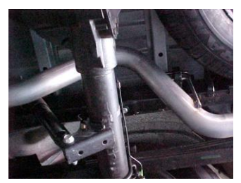
5. Install the overaxle tailpipe #C into the muffler 1½-2". Insert welded hanger into rubber grommet. Use clamp #E to secure tailpipe to muffler. DO NOT TIGHTEN.

4. Slide band clamp #F onto muffler #B. Insert hangers into rubber grommet and attach with bolt kit #G. DO NOT TIGHTEN