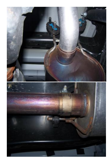
1. To remove the stock exhaust un-clamp it just behind the stock muffler. Then un-clamp stock muffler and remove. Leave all rubber grommets in place. Use WD-40 to aid in removal of exhaust.