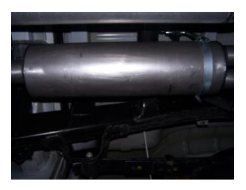
3. Install muffler #B onto head pipe #A 1\frac{1}{2} "-2" with the louvers facing towards the converter. Use a jack stand to support the muffler. Use clamp #E to secure the muffler to the head pipe. DO NOT TIGHTEN. Muffler inlet is looking into the louvers.