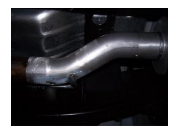
2. Install head pipe #A onto your existing stock front pipe and attach with clamp #E. Use a jack stand to support the converter. Insert welded hanger into rubber grommet.