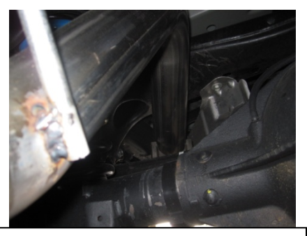
5. With everything loose you may need to adjust the system for proper clearance of shocks, brake lines, ect.