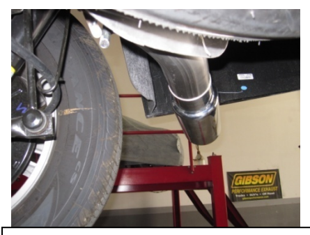
from spare tire install the exhaust tip onto the tailpipe. The system was designed to have the tip 1" below the quarter panel of the vehicle. With the tip in your desired position begin to tighten down all clamp connections from the