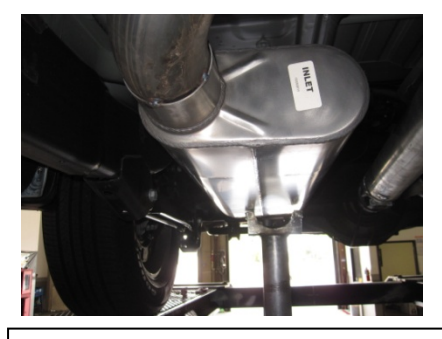
3. Install muffler #B onto headpipe 1.5" to 2" muffler should be level use clamp #E to secure together do not tighten.