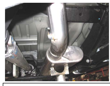
4. Install over axle pipe Item # C into the muffler outlet. Slip the hangers into the rubber grommets and keep tailpipe loose use clamp #E to secure together.