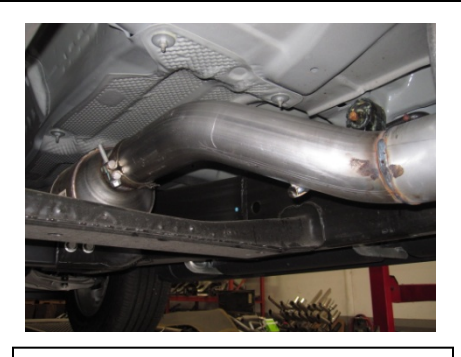
1.Install headpipe #A onto your factory pipe using your stock clamp insert welded hanger into the rubber grommet leave clamp loose.

1. Disconnect the negative battery cable before removal of the OEM Exhaust. This will allow the computer to reset and recognize the new exhaust. Lay out the exhaust on the floor so it looks like the drawing and compare parts with manual. Remove the factory exhaust by cutting behind the factory muffler. Once the tail pipe has been removed un-bolt the muffler and head pipe at the clamp located in front of the factory muffler. Use wd-40 or another type of penetrating oil to remove the rubber grommets. Do not damage these they will be re used.