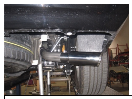
7. Be sure to check all clearance after each section has been tightened to be sure there is proper clearance. It may take 4-500 miles for your vehicle to fully adjust to the changes in exhaust flow.

"MAKE SURE YOU HAVE A 1" CLEARANCE ON ALL PIPES FROM ALL RUBBER BRAKE LINES, SHOCK BOOTS, TIRES, ETC..." TORQUE ALL CLAMPS TO APPROX. 100 TO 150 FT LBS.