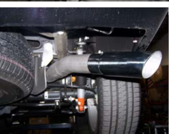
6. Install exit pipe #D into the tailpipe 1½-2" and secure with clamp #F. DO NOT TIGHTEN. Rotate pipe to best suit your vehicle.

4. Install muffler #B onto head pipe 1½"-2" with the louvers facing towards the converter. Use a jack stand to support the muffler. Use clamp #F to secure the muffler to the headpipe. DO NOT TIGHTEN. Muffler inlet is looking into louvers.