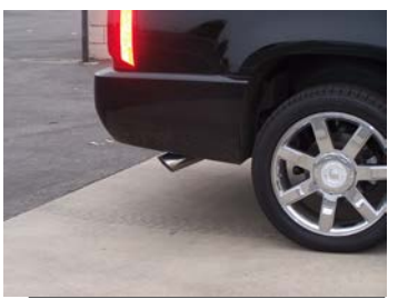
7. Install stainless steel tip #E. Clamp down. When you have everything in place, firmly tighten all bolts and clamps down securely. Use stainless steel cleaner and a Scotch Brite pad weekly to prevent tip from discoloration.

GIBSON EXHAUST systems are designed on a factory stock vehicle Any aftermarket products installed could increase the sound levels of the exhaust. Make sure there is a 1" clearance from ALL rubber brake lines, shock boots, lines, tires, etc. to prevent heat related damage or fire.