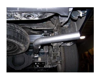
7. Install exit pipe #H onto the tailpipe, use clamp #F to secure the two pipes together. (Rotate for the best fit on your vehicle.)