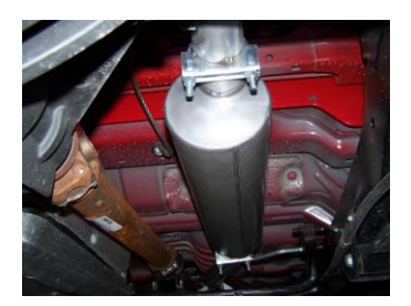
4. Install muffler #B onto headpipe #A 1.5-2" with louvers facing towards the converter. Use a jack stand to support the muffler. Outlet of muffler will be at 12 o'clock position.