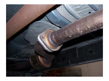
2. To remove your stock exhaust, unbolt the 2-bolt flange located in front of the muffler. Then cut off your tailpipe. Leave all rubber grommets in place. Use WD-40 to aid in the removal of the hangers from the rubber grommets.

1. Disconnect the negative battery cable before removal of OEM exhaust. This will allow the computer to reset and recognize the new exhaust. Lay out the exhaust on the floor so it looks like the drawing and compare parts with manual.