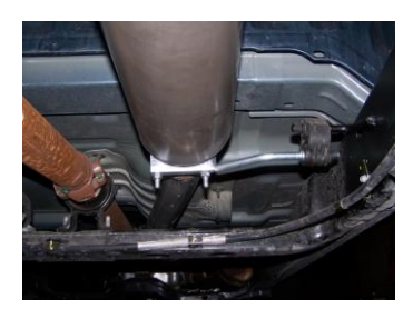
5. Next, install front muffler hanger #E onto muffler. Insert hanger into rubber grommets. Do not tighten.

8. Install stainless steel tip. Clamp down. When you have everything in place, firmly tighten all bolts and clamps down securely. Use stainless steel cleaner and a Scotch Brite pad weekly to prevent tip from discoloration. Inspect all fasteners after 25-50 miles of operation and re-tighten as necessary.