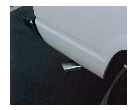
INSTALL TURNOUT PIPE #D INTO TAILPIPE USING CLAMP #G . INSTALL THE STAINLESS TIP AND CLAMP DOWN. USE ANY STAINLESS STEEL OR ALUMINUM CLEANER TO POLISH TIP.

SLIDE MUFFLER WITH DUAL INLET ONTO HEADPIPE AT LEAST 1-1/2" TO 2". MUFFLER OUTLET SHOULD BE AT THE 6 O'CLOCK POSITION. USE CLAMPS #F TO ATTACH IT TO THE HEADPIPE. INSERT WELDED HANGER INTO RUBBER GROMMET. MAKE SURE INLETS AND MUFFLER IS LEVEL. AND TIGHTEN DOWN. USE JACK STAND TO SUPPORT MUFFLER.