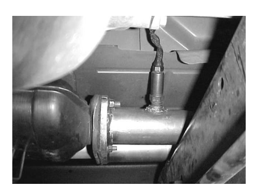
RE-INSTALL O2 SENSOR. USE A SMALL AMOUNT ANTI-SIEZE ON THE THREADS. NOW FIRMLY TIGHTEN ALL CLAMPS, HANGERS, FLANGE, AND BOLTS.