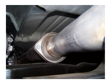
5. Slide the over axle tailpipe #C into the muffler 1.5-2". Use clamp #E to secure tailpipe to muffler. Do not tighten. Insert welded hangers into rubber grommets.

3. Install headpipe #A onto your existing stock front pipe and attach using stock hardware. Do not tighten. Insert welded hanger into rubber grommet.