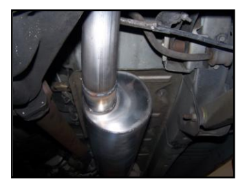
3. Install the Gibson muffler in the same position as the stock muffler and clamp to stock pipe with clamp #D. Muffler may angle down at back. Inlet of muffler is looking into the louvers. DO NOT TIGHTEN.