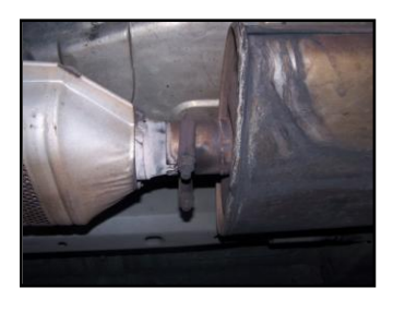
2. Unclamp and remove the stock exhaust from behind the catalytic converter. Use jack stand to support the converter. For easier removal and installation unbolt the rear hanger bracket.

1. Disconnect the negative battery cable before removal of OEM exhaust. This will allow the computer to reset and recognize the new exhaust. Lay out the exhaust on the floor so it looks like the drawing and compare parts with manual.