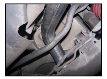
4. Install tailpipe #B into rear of muffler. Insert welded hanger into rubber grommet. Use clamp #E to attach tailpipe to muffler. DO NOT TIGHTEN.