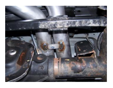
6. Use bolt kit #I to connect the tabs together on the tailpipes. Do not tighten.

5. Now slide driver side tailpipe #E and passenger side tailpipe #D into muffler. Use clamps #G to attach tailpipes to muffler. Do not tighten. Insert both hangers into rubber grommets.