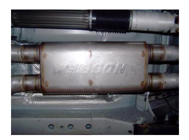
4. Install muffler #C onto headpipes 1.5-2". Use a jack stand to support muffler. Use clamp #G to attach muffler to headpipes. Do not tighten.