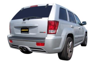
8. When you have everything in place, firmly tighten all bolts and clamps down securely. Start from the front of the vehicle and work your way to the back. Use stainless steel cleaner and a Scotch Brite pad weekly to prevent tip from discoloration. Inspect all fasteners after 25-50 miles of operation and re-tighten as necessary.

GIBSON EXHAUST systems are designed on a factory stock vehicle. Any aftermarket products installed could increase the sound levels of the exhaust. Make sure there is a 1" clearance from ALL rubber brake lines, shock boots, lines, tires, etc. to prevent heat related damage or fire.