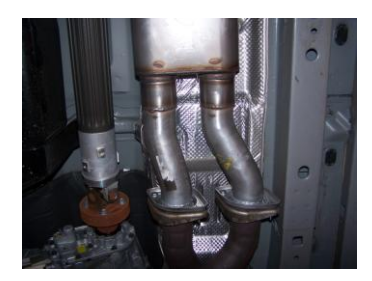
3. Install passenger side headpipe #A onto stock flanges using bolt kit #H. Do not tighten. Then install driver side headpipe #B using bolt kit #H. Do not tighten.