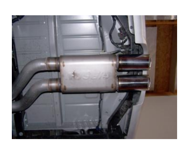
7. Install rear muffler assembly #F onto tailpipes. Use clamps #G to attach muffler to tailpipes. Do not tighten. Insert welded hangers into rubber grommets.