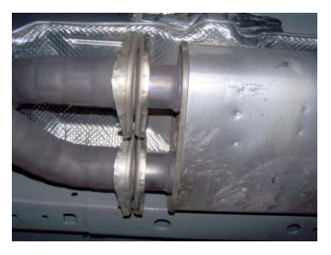
2. To remove the stock exhaust, unbolt the tailpipes at the clamps behind the over axle pipe. Then disengage hangers from the rubber grommets, and remove the rear tailpipes and mufflers. Now remove all other hangers from rubber grommets and unbolt the rest of the exhaust system at the 2 flanges in front of the stock muffler.