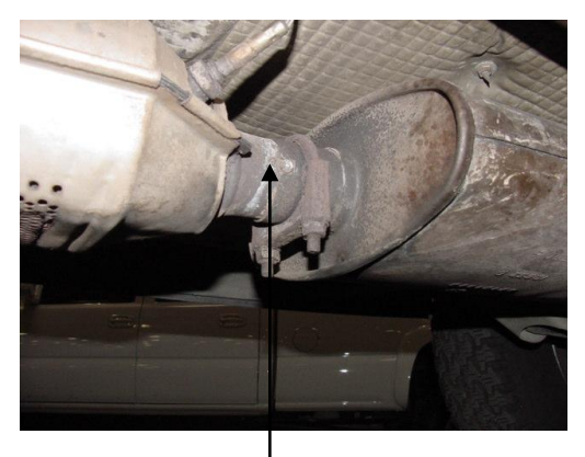
CUT 1" OFF BEHIND THE CONVERTER SO THE NOTCH IN THE MUFFLER WILL SLIP ON COMPLETELY.

LAY OUT THE EXHAUST AND COMPARE PART NUMBERS WITH THE DRAWING.