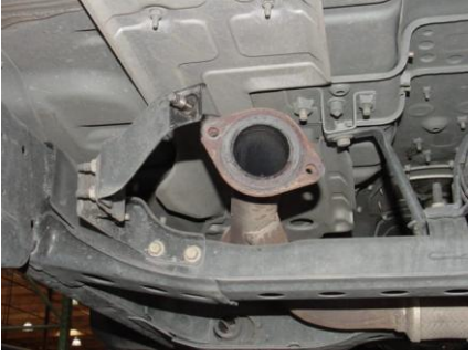
INSTALL HEADPIPE #A ONTO STOCK FLANGE, RE-USING YOUR STOCK GASKET, NUTS AND BOLTS. DO NOT TIGHTEN. JUST SNUG IT UP. INSERT HANGER INTO RUBBER

TO REMOVE STOCK EXHAUST, UN-BOLT THE 2-BOLT FLANGE LOCATED JUST IN FRONT OF THE STOCK MUFFLER. DO NOT DAMAGE STOCK NUTS, BOLTS AND GASKET. YOU WILL NEED TO RE-USE THEM.