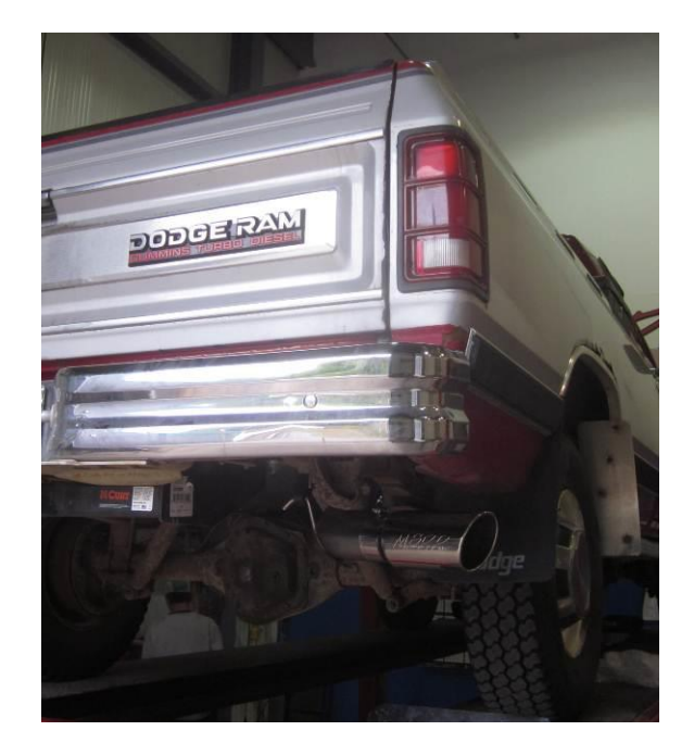
Congratulations! You are ready to begin experiencing the improved power, sound and driving excitement of your MBRP Inc. performance exhaust system. We know you will enjoy your purchase.

9. Adjust the Tail Pipe and check along the whole length of the exhaust system to ensure there is adequate clearance around the fuel and brake lines or any wiring. If any interference is detected relocate or adjust. Start at the front of the exhaust system and begin tightening all connections.