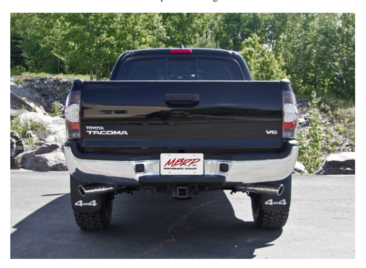
Congratulations! You are ready to begin experiencing the improved power, sound and driving excitement of your MBRP Inc. , performance exhaust system. We know you will enjoy your purchase.