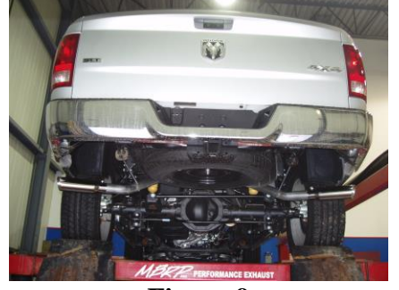
Figure 9 S5144 © 05/18