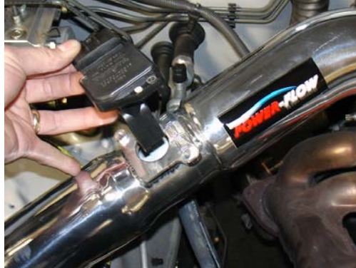
Take the mass air flow sensor and carefully insert it into the machined sensor adapter. We recommend you use a dab of light oil of water to wet the O-ring. This will allow the O-ring to slip into the hole for a better seal.