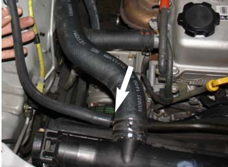
The 14"-10mm vacuum hose is now connected to the charcoal canister hard pipe.