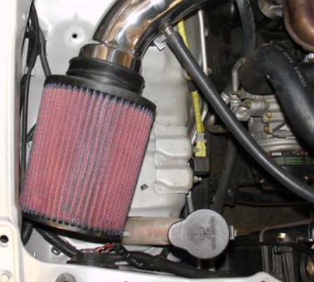
Once the filter has been placed over the intake end and the intake is set up against the filter stop contin-ue to tighten the filter clamp.