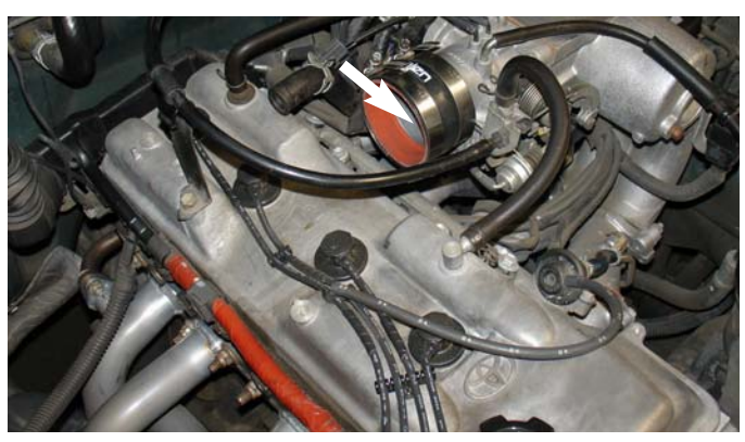
Press the 2 3/4" straight hose over the throttle body and use two .312 powerbands. At this point, you will only tighten the band on the throttle body side.