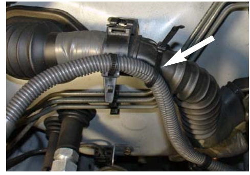
Use the zip tie to secure the sensor harness to the ECU main harness as shown above.