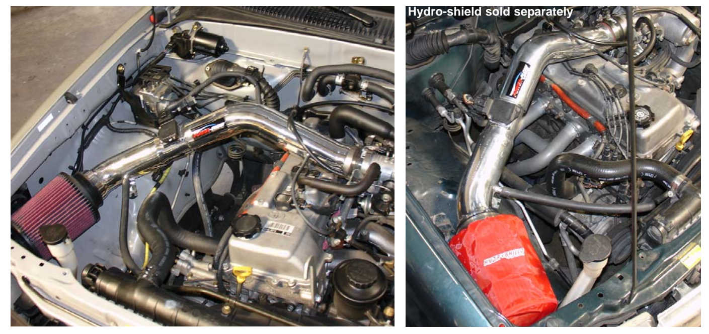
You have purchased the Worlds first tuned intake system available anywhere. The Power-Flow intake system features Injen's patent pending MR Technology used to tune the intake. With Power-Flow, calibrating of the MAF sensor is not required because the intake system comes tuned for use. Use only Injen replacement filters. The use of any other filter will change the air/fuel ratio that can cause damage to your engine.