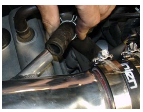
The flange nut and fender washer is screwed onto the The stock crank case breather hose is reconnected to the 5/8" intake port located by the firewall.