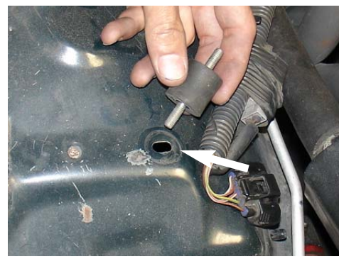
Insert vibra-mount into the pre-drill hole located on the fender well.