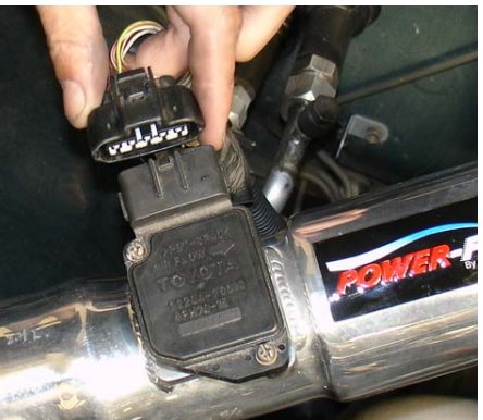
Take the harness clip and press it over the mass air flow sensor until you hear it snap in place, this will assure a good connection.

Once the mass air flow sensor has been firmly inserted into the machined sensor adapter continue to use the stock screws to fasten the sensor to the adapter.