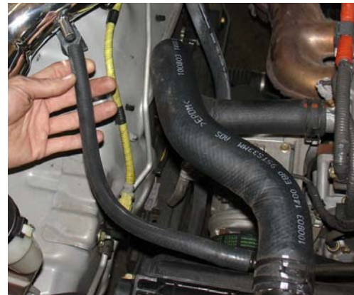
The 14"- 10mm vacuum hose is now pressed over the 1/2" intake port as shown above. Page 3 of Part# PF2010