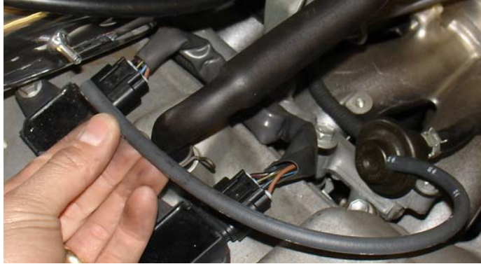
The stock 4mm pressure fuel regulator line is now pressed onto the 3/16" intake port.