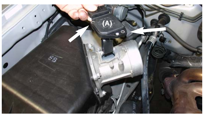
Remove the screws from the mass air flow sensor (A) and carefully pull the air sensor out of the sensor housing.