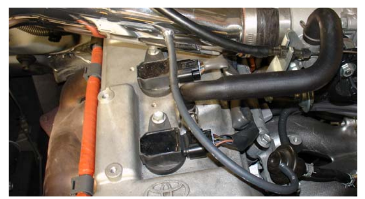
A good shot of the 4mm line connected to the pressure fuel regulator and the 3/16" intake port.