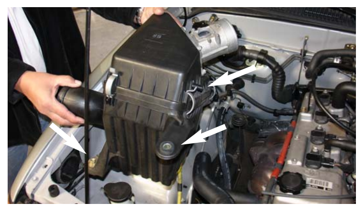
Remove the m6 bolts holding the air intake box to the fender well. Remove the vacuum hose connected to the air box. Pull the air intake box out of the engine compartment.