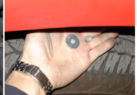
Go underneath the fender well, take the m6 flange nut and fender washer and secure the vibra-mount to the fender well.