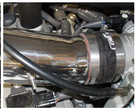
The intake is inserted into the throttle body hose and the intake bracket is lined up to the vibra-mount stud.