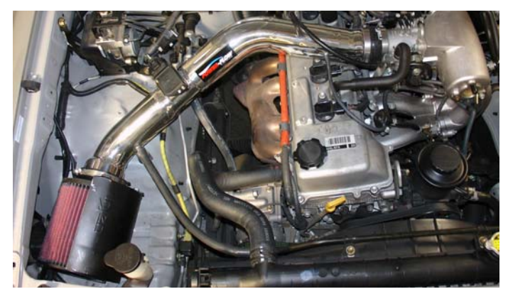
Once the intake has been installed, continue to align the entire intake for the best possible fit. Once the intake has been cleared from all objects continue to tighten all nuts, bolts and clamps. The heat-shield is now sold separately on line at "www.injenonline.com".