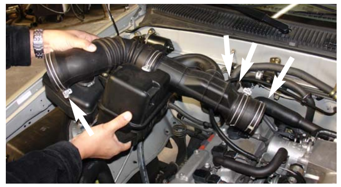
Loosen the clamps on the air intake box and the throttle body, remove the two vacuum lines connected to the intake and then continue to remove the air intake duct as shown above.