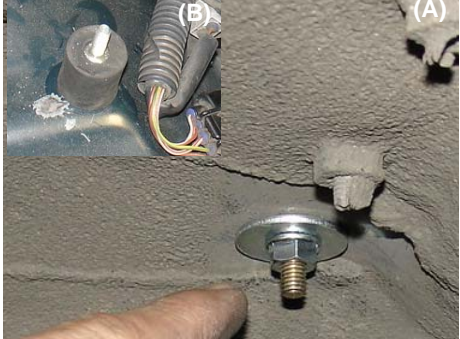
The flange nut and fender washer is fastened to the vibra-mount stud, view from inside wheel well (A). Vibra-mount is now installed, view from engine compartment (B).