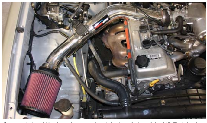
Congratulations! You have just completed the installation of the MR Tech intake system. Periodically, check the fitment of the intake system to make sure nothing has shifted or is rubbing up against anything. Regular maintenance will enhance the life of your intake system and protect you from possible voiding the warranty.