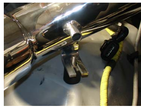
The intake bracket is sitting flush over the vibra-mount stud and lined up to the throttle body.