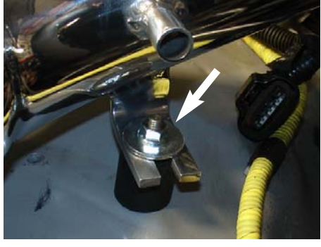
vibra-mount stud. Do not over- tighten the flange nut at this point until the filter has been placed on the end.