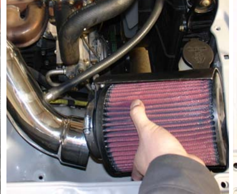
The 3 1/2" inverted top filter is set in the engine compartment ready to be installed.