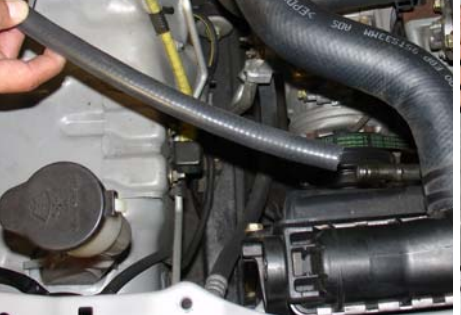
The 14" -10mm hose is pressed over the charcoal canister hard pipe.