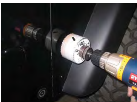
4. Remove the template from the fender. Drill a 3" hole with a hole saw on the top 1/8" pilot hole and a 3/8" hole with a drill bit on the lower pilot hole.