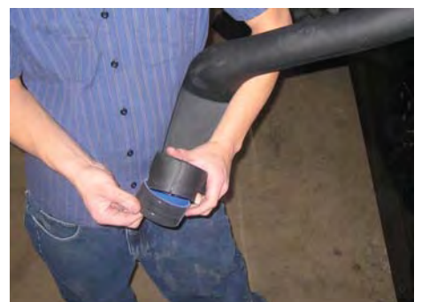
6. Place the 3" X 3" sleeve on the small opening of the Volant down pipe and the 3/4" X 2" sleeve on the other end of the short snorkel..