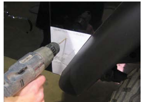
3. Once the template is lined up and taped to the fender, drill two 1/8" pilot holes as noted on the template.