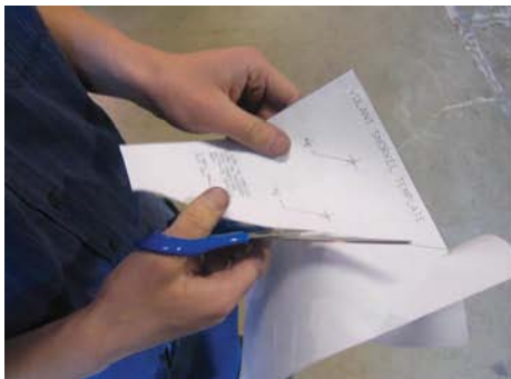
1. Cut out the template along the dotted line with a pair of scissors.