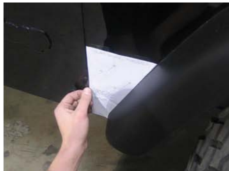
2. Align template along the side base of the jeeps passenger fender. Tape the template to the fender.