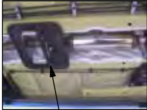
TUNNEL BRACE (TO BE RE-USED)