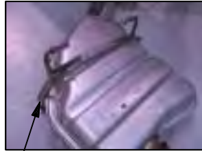
HANGER STRAP (TO BE REMOVED)