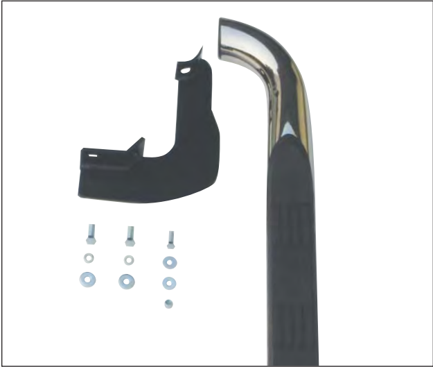
PASSENGER FRONT -