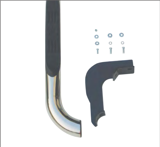
DRIVER REAR -