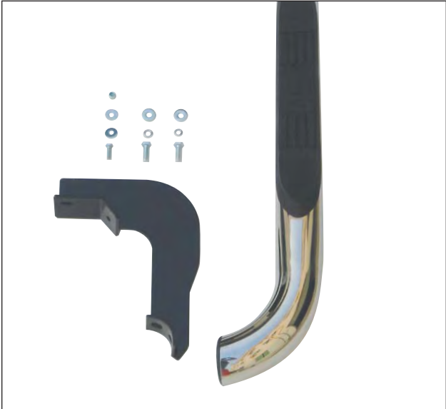
PASSENGER REAR -