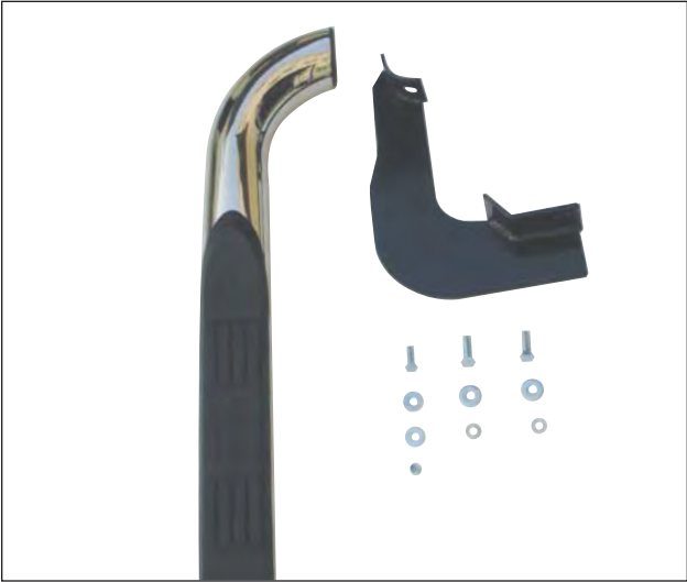
DRIVER FRONT -