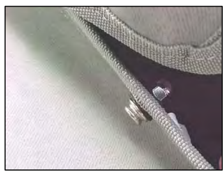
Figure 9 Figure 10 Figure 11

3. The Connector Flap is now attached to the Tonneau. Snap together with the Wind Breaker and installation is complete (Figure 12).