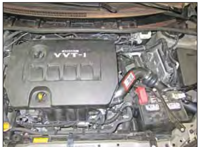
AEM® intake system installed