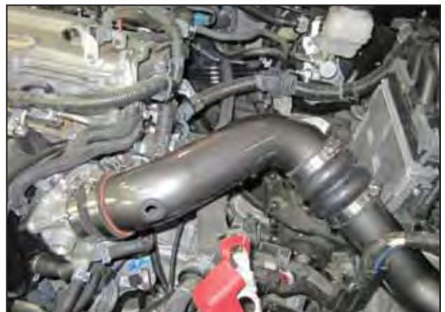
i. Install the upper inlet pipe ensuring it is evenly distributed in the coupler and hump hose. Secure the pipe in place by tightening the hose clamps.