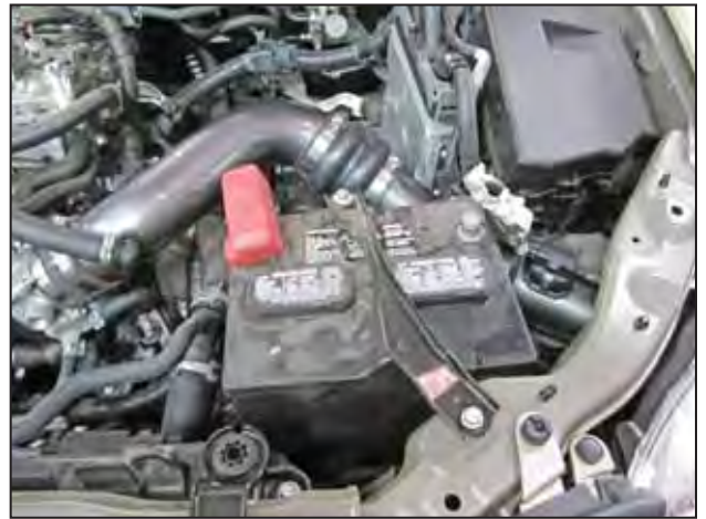
m. Install the plastic battery tray, the battery and the battery tie down. Reconnect the positive battery terminal. Refer to the owner's manual for specific details regarding battery installation.