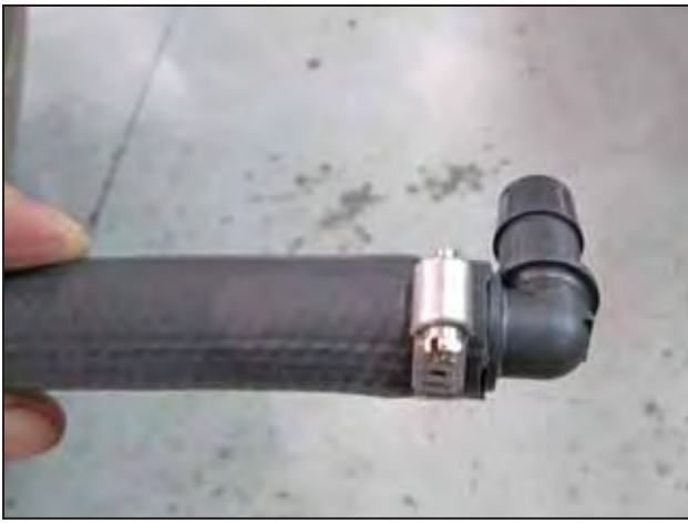
j. Slide the 5/8" hose over the 90° plastic elbow and secure it with the hose clamp (# 99024.032).