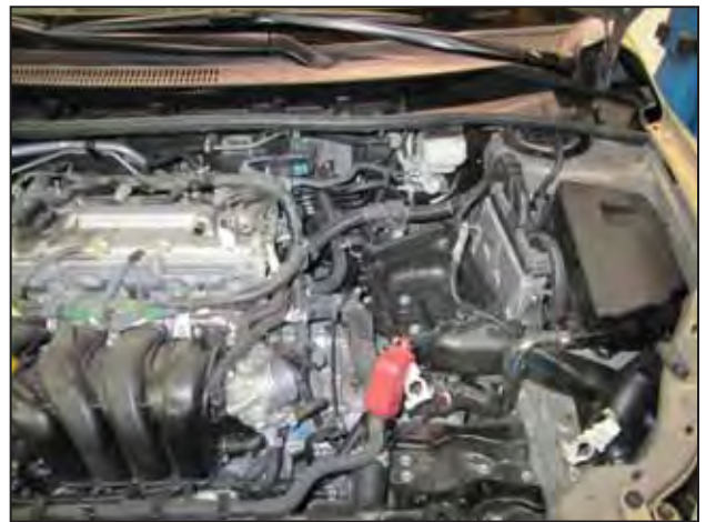
h. Remove the intake hose and upper air filter housing from the vehicle, and then remove the filter element from the lower air filter housing.