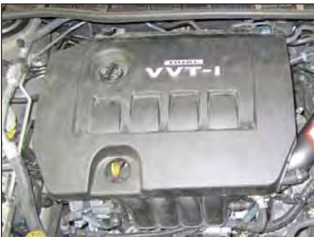
n. Install the engine cover.