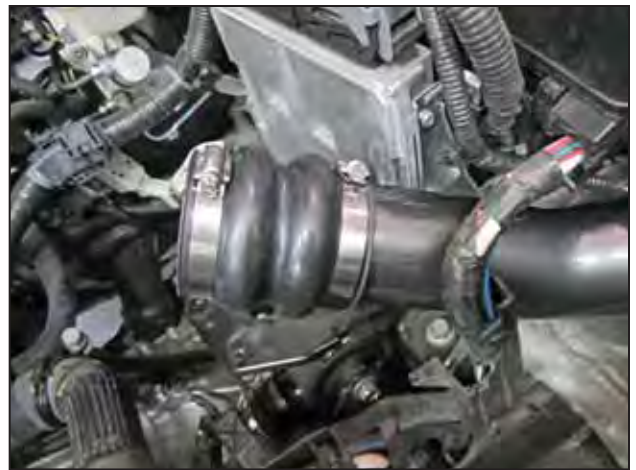
g. Slip the double hump hose onto the inlet pipe, but do not completely tighten the #9444 hose clamps.