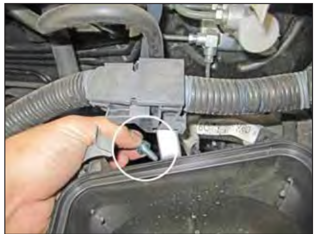
j. Remove the bolt that secures the harness bracket to the back of the lower air filter housing.