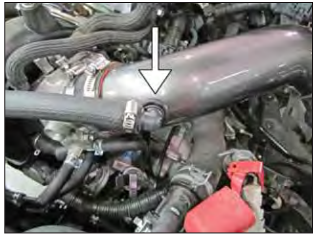
k. Press the exposed end of the plastic elbow into the grommet hole. Soapy water may ease the installation of the plastic elbow into the grommet.