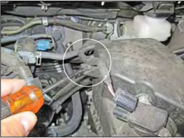
e. Remove the MAF sensor harness clip from the air filter housing.