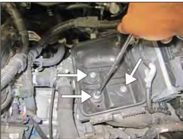
i. Remove the 3 bolts that secure the lower air filter housing to the vehicle chassis.