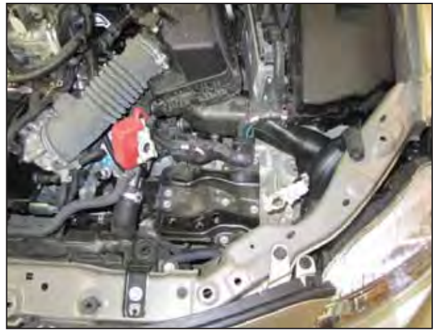
b. Disconnect the positive battery terminal. Remove the battery and plastic battery tray. Refer to the owner's manual for specific details regarding battery removal.