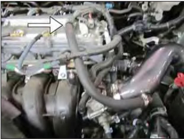
l. Attach the other end of the hose onto the PCV vent and secured it with a supplied hose clamp (# 99024.032).