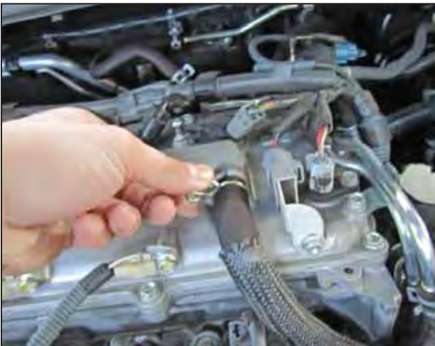
c. Pinch the hose clamp securing the PCV hose to the vent tube on the valve cover, then remove the hose.