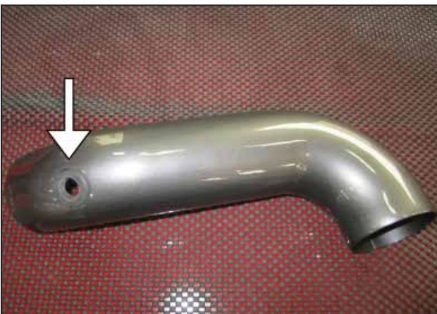
h. Install the grommet into the hole of the upper inlet pipe.