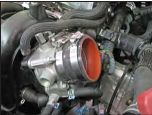
f. Attach the throttle body coupler to the throttle body with a #9444 and #9440 hose clamp.