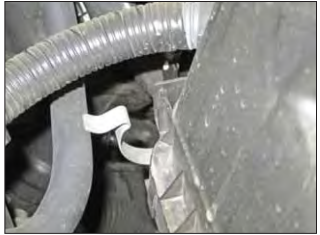
f. Unlock the two clips at the back of the air filter housing.