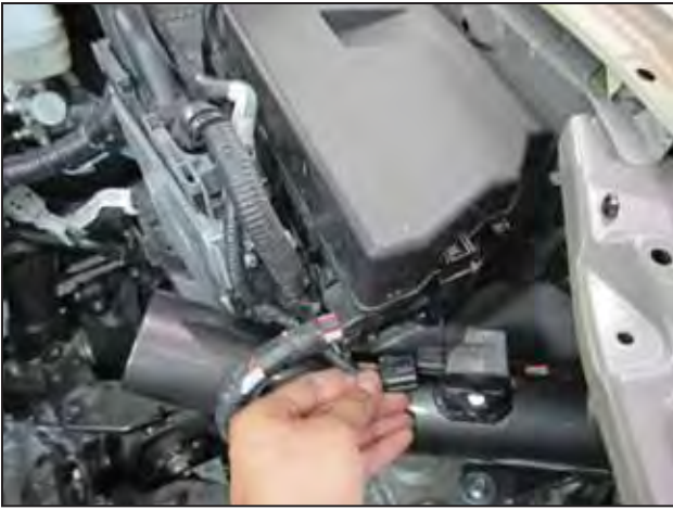
d. Route the MAF sensor harness to the ETI module as shown, connect the harness connector to the ETI module.