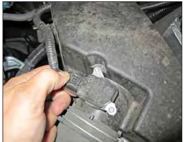
d. Unplug the MAF harness connector from the MAF sensor.