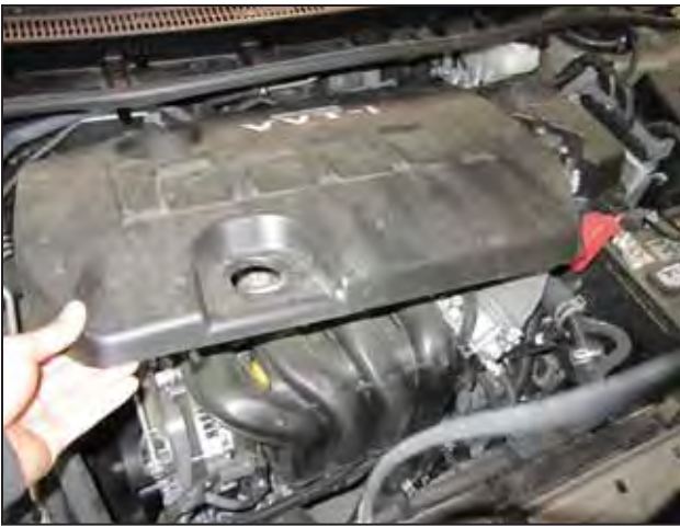
a. Remove the plastic engine cover.