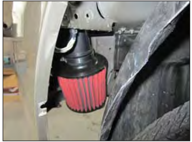
e. Attach the air filter to the lower end of the lower inlet pipe with hose clamp #9444.