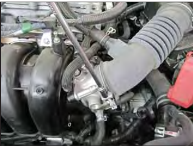
g. Loosen the hose clamp that secures the intake hose to the throttle body.